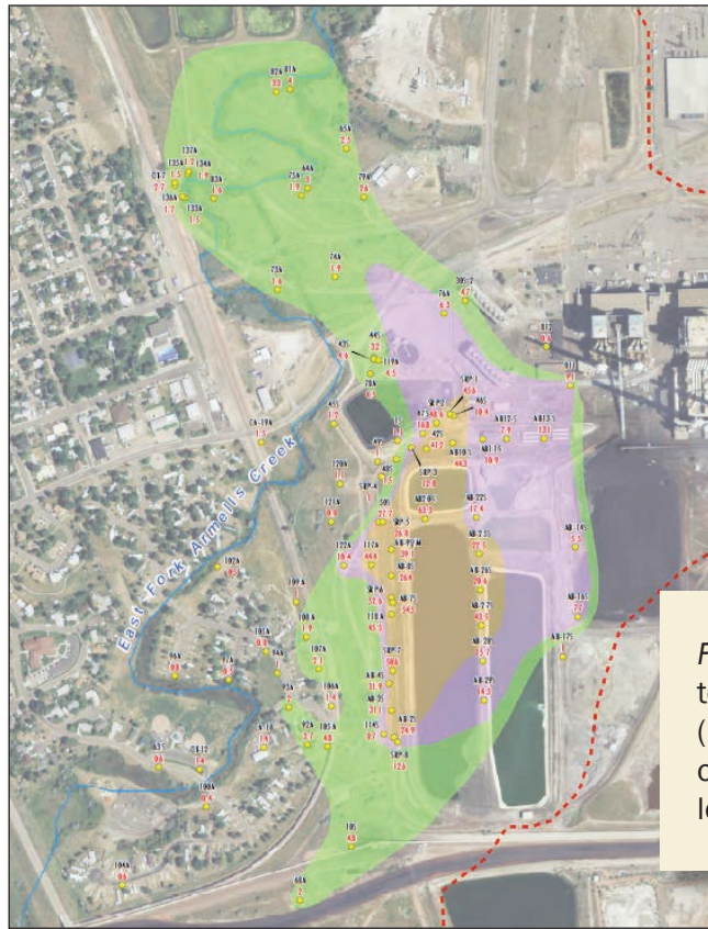
Figure 1: Groundwater contamination map submitted to the Montana Department of Environmental Quality (DEQ) by Colstrip plant owners. According to plant owners, boron serves as an indicator of the plume's location and concentration.

THE ASH PONDS LEAK 367 GALLONS PER MINUTE, OR 200 MILLION GALLONS A YEAR. THEY HAVE BEEN LEAKING SINCE THEIR CONSTRUCTION MORE THAN 30 YEARS AGO. 2